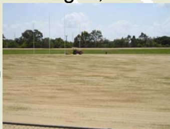
Southport Sharks AFL field aerated, treated, topdressed and levelled.

Identify your challenges, develop a strategy and commence implementation.