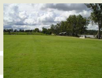
Rocks Riverside Park Great Lawn.