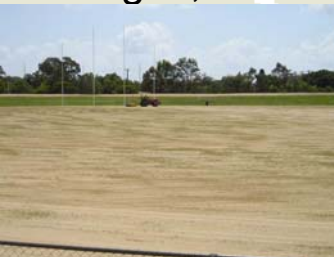
Southport Sharks AFL field aerated, treated, topdressed and levelled.

Identify your challenges, develop a strategy and commence implementation.