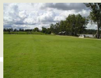
Rocks Riverside Park Great Lawn.